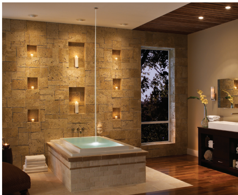
This CandleWall employs a Dry-Stack grout technique which requires no surface grouting.

Each piece is laid 0.5" apart. The grout should overlap the face of the veneer, widening the joints and making them very irregular. (See page 4.)