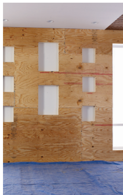
Wood stud framing over existing wall, location of candle niches and ply-wood sheathing.