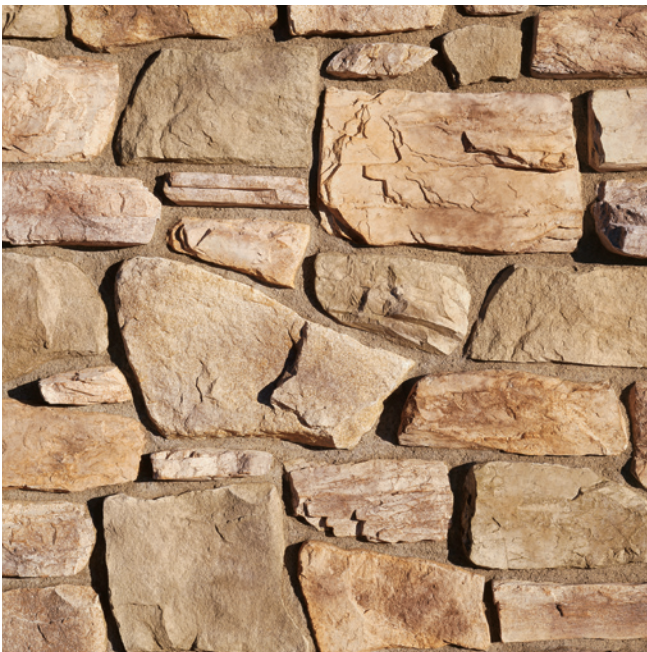
MOLANO Hillstone with a Standard grout technique. A Standard grout technique exposes the edge details of each stone.