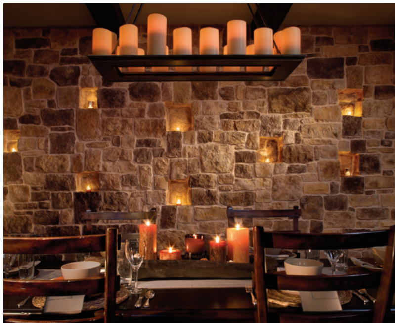
This alternate CandleWall, installed with Autumn Leaf RoughCut, uses an Overgrout technique.