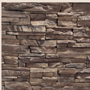
Santa Fe STACKED STONE®

The CandleWall showcased in this Idea Book uses Sanibel CoastalReef. You may wish to use a different profile.