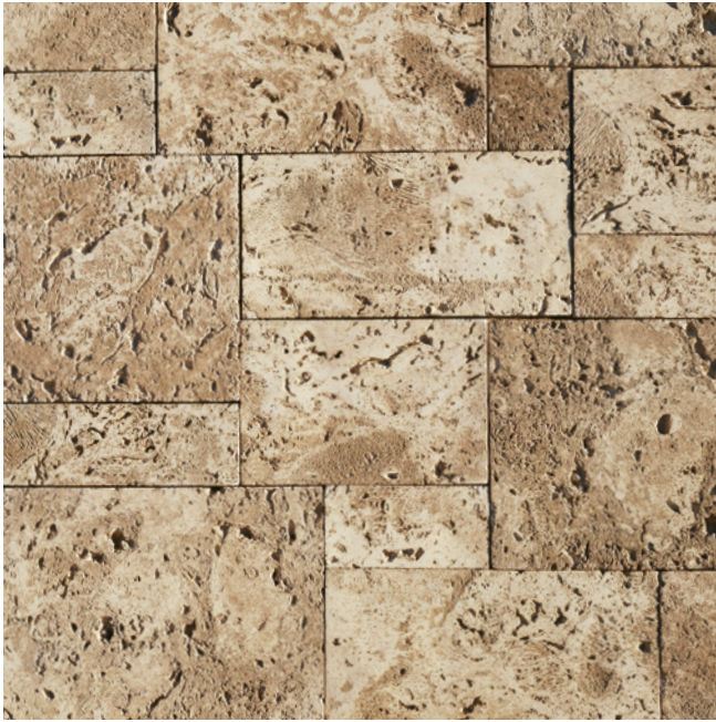
SANIBEL CoastalReef with a Dry-Stack grout technique was specified for the CandleWall represented in this Idea Book.