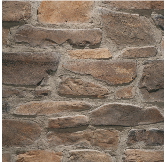
VENETO Fieldledge with an Overgrout technique illustrates how rustic and old-world the face appears when Overgrout is installed.